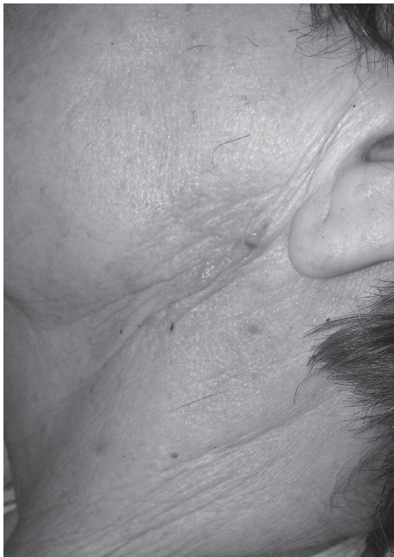
Figure 5 – Retromandibular incision, 2 months after surgery.

the screws). Next a 2-cm vertical retromandibular skin incision was done – behind the edge of the mandible, revealing the capsule of the parotid gland. Blunt dissection superficial to the capsule to expose the anterior edge of the gland, which was then retracted posteriorly. The masseter muscle was then penetrated (between visualized branches of the facial nerve) leading to the external surface of the mandible, which would be chased to the location of the sub-condylar fracture. DePuy Synthes osteosynthesis material (Johnson and Johnson, USA) was used to fix the fragments utilising: 2 straight plates (25 fractures), a trapezoidal plate (TCP – 12 fractures), an L-shaped plate (in 7 fractures).