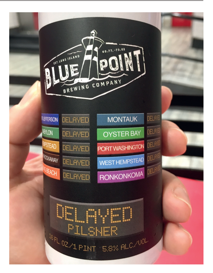
Fig. 3 DELAYED, New York, United States.

The beer labels pictured in Figures 1 and 2 demonstrate how the practice of local history represents the power of place within a PBD in Brittany, France and Montreal, Canada. They speak to the contested power relations which spatially embed "imagined" communities and generate potential value-addition within GPNs, especially in the case of locally-owned Brasserie Dieu du Ciel! and TNC-owned Unibroue, both of which generate their own, agonistically opposed historical visions of place, their power relations via