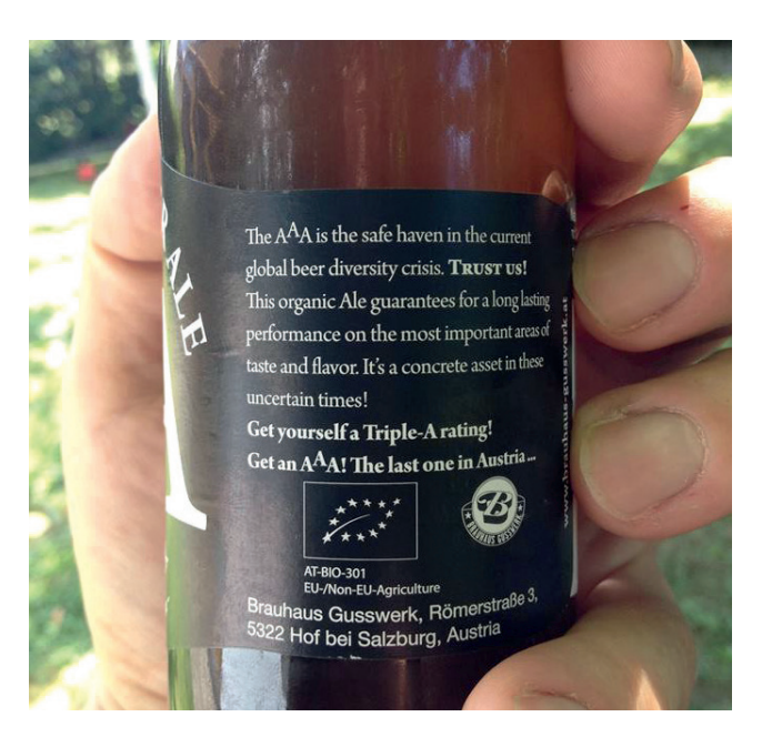
Fig. 4 Austrian Amber Ale, Salzburg, Austria.

'DELAYED' exhibits a goodness of fit with the nonplace discourse, and its label eschews traditional visual discourses otherwise reserved for the interpretation of landscapes – there are no representations of land or water on the label, other than within the Blue Point imprint 'stamped' on the forehead of the can. No working landscape or ecology recreates an original nature to which the beer owes an origin. Missing from the scene are liberty-capped peasants there to drive state agents away from their land, labor, history, and the rightful possession of capital tied to place. The label does not engage the viewer with a cinematographer's eye for reconstructing a past scene of an