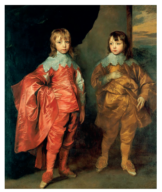
Figure 9. Anton van Dyck – Portrait of George Villiers (1635) – Huntington Library