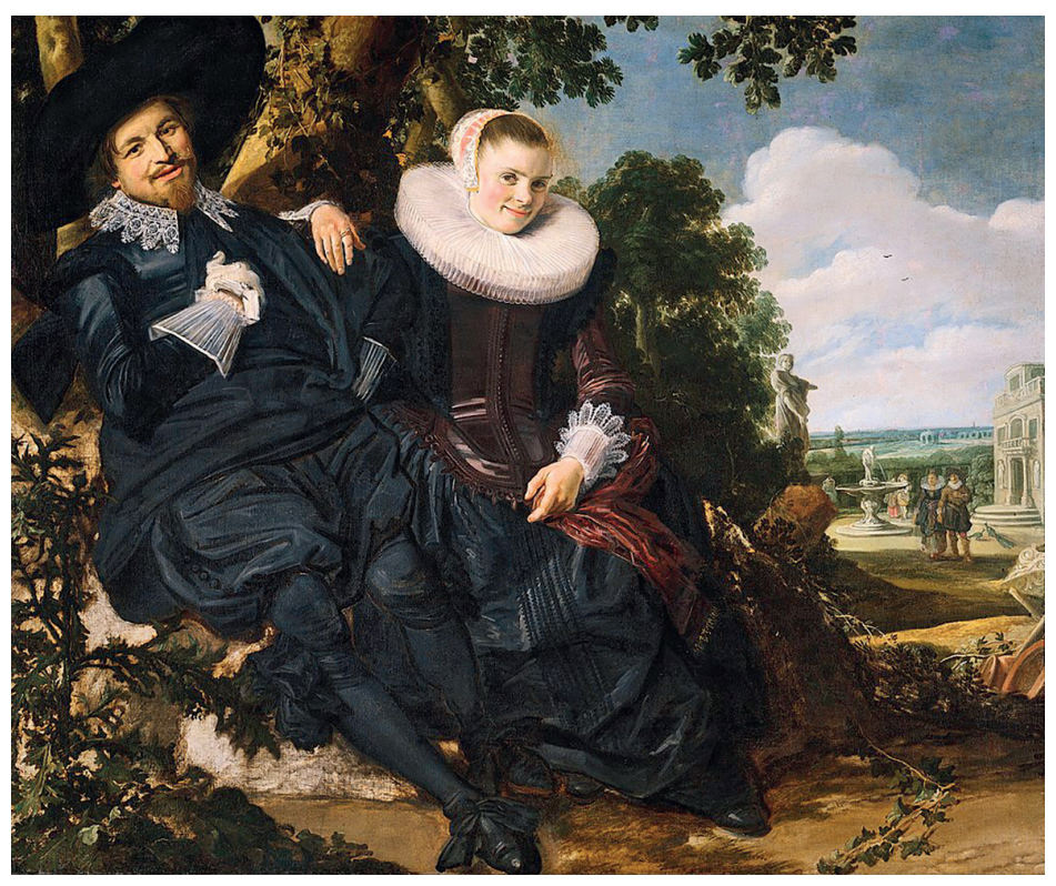
Figure 16. Frans Hals – Marriage Portrait of Isaac Massa and Beatrix van der Laen (1622) – Rijksmuseum, Amsterdam

In the fifteenth century, painters like Jan van Eyck or Rogier van der Weyden largely responded to the contemporary taste of the court and the church, though at the same time exhibiting their individual talents (Beheydt 2015). Van Eyck primarily satisfied the Burgundian need for display of wealth and luxury, whereas Van der Weyden responded to the societal urge for devout drama. Thus, Van Eyck, when asked to portrait the Bur-