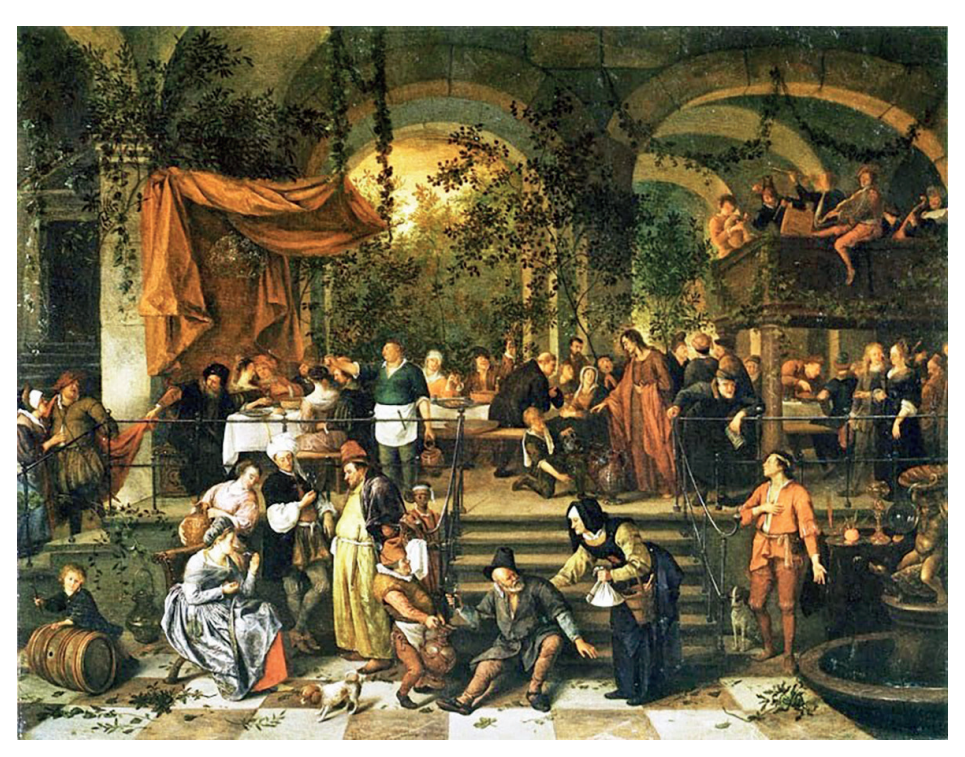
Figure 15. Jan Steen – The Wedding at Cana (ca. 1670) – National gallery of Ireland, Dublin