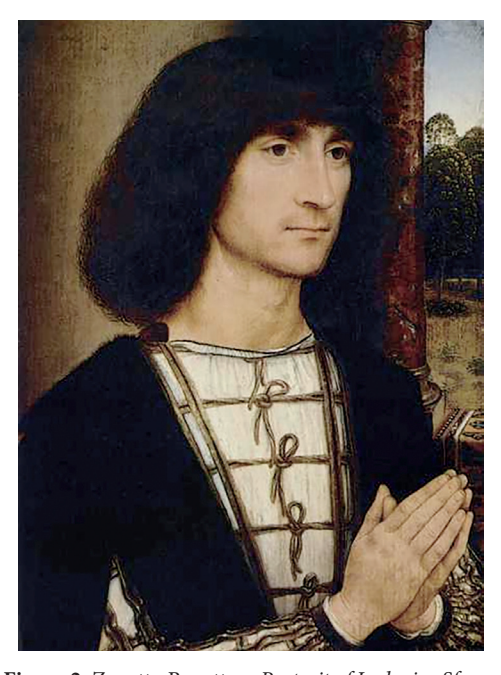
Figure 2. Zanetto Bugatto - Portrait of Lodovico Sforza

The assimilation of Italian influences by some Netherlandish artists in the early modern times became so strong that they got designated as 'Italianists' or 'Romanists', names which originally had a disapproving connotation (Dacos 1995: 14). Admittedly, Italian mannerism and 'Romanism' had a great impact on Netherlandish painting of the 16<sup>th</sup> century. Many painters from the Low Countries did their 'Grand Tour' in Italy and