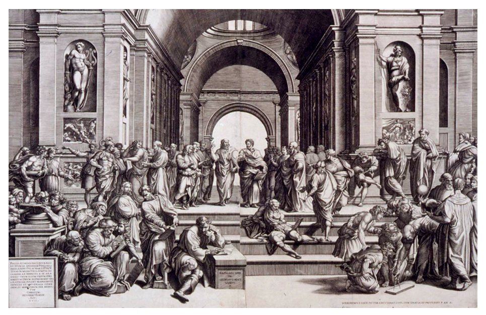
Figure 14. Giorgio Ghisi – The School of Athens, print (1550) after Raphael