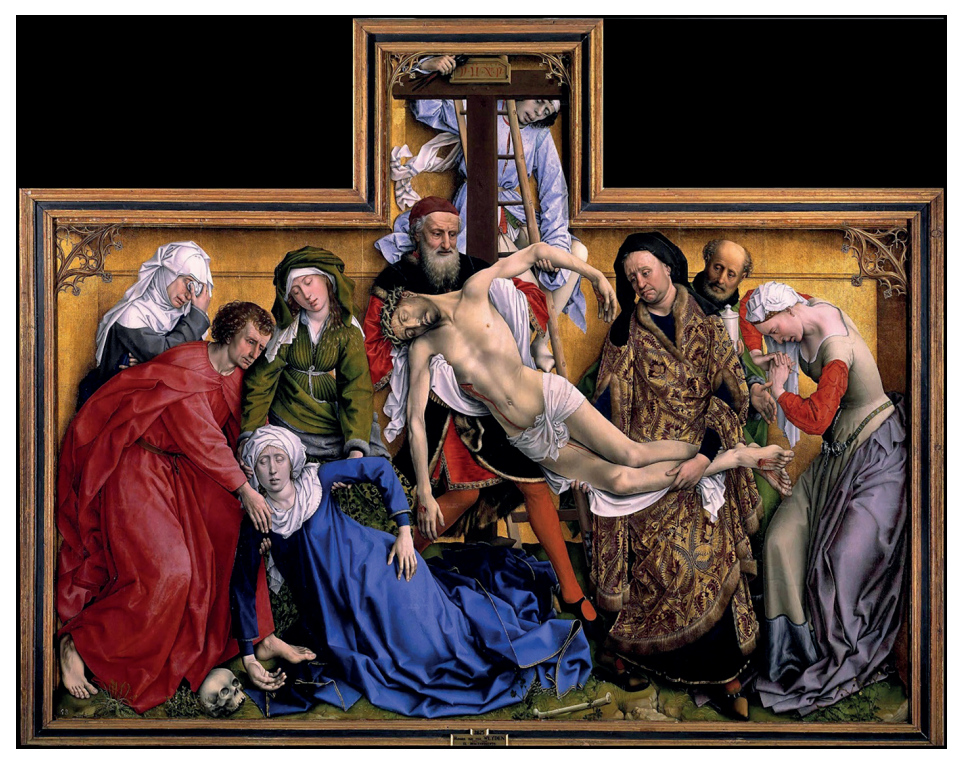
Figure 1. Rogier van der Weyden - The Deposition (1435) - Museo del Prado, Madrid

stay at the court of Ferrara and by the Ferrarese painter Cosmè Tura in the late 1450s suggests study of the technique of Rogier van der Weyden, whose famous triptych of the Deposition (Figure 1) was present at the humanist court of Leonello d'Este as we know from its eulogistic description by the antiquary Ciriaco d'Ancona in 1449. But certainly in Florence painting alla fiamminga became trendy and an emulation of Netherlandish visual qualities of Jan Van Eyck's and Rogier Van der Weyden's work, such as the eye for minute detail and the technical virtuosity, changed the way of Florentine painting thoroughly (Nuttall 2004).