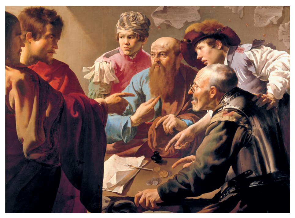
Figure 21. Hendrick Terbrugghen - The Calling of Saint Matthew (1621) - Centraal Museum, Utrecht

Not only in Flanders, in the Dutch Republic too, the foreign influences were absorbed and merged into the native tradition. In that respect, I wanted to come back to the already mentioned Utrecht School of the seventeenth century, which brought caravaggesque influences tot the Dutch Republic through the work of Honthorst, Baburen en Terbrugghen. Just to show how the Netherlandish character is preserved in otherwise caravaggesque works, let me compare the same biblical theme in a painting by Michelangelo Merisi da Caravaggio (1599–1600) (Figure 20) and in one by Hendrick Terbrugghen (Figure 21). Surely, Terbrugghen's Calling of Saint Matthew (1621) is deeply influenced by Caravaggio's example in its strong dramatic composition and chiaroscuro, but the treatment of the facial physiognomy shows at the same time that Terbrugghen is deeply rooted in the Netherlandish tradition. The verisimilitude of the bewilderment in the face of the tax collector and of the miserly greediness in the old man remind us of types popularized by early 16<sup>th</sup> century Flemish artists. And the light in the painting, in line with the older Netherlandish tradition, is less hard and more atmospheric than with Caravaggio.