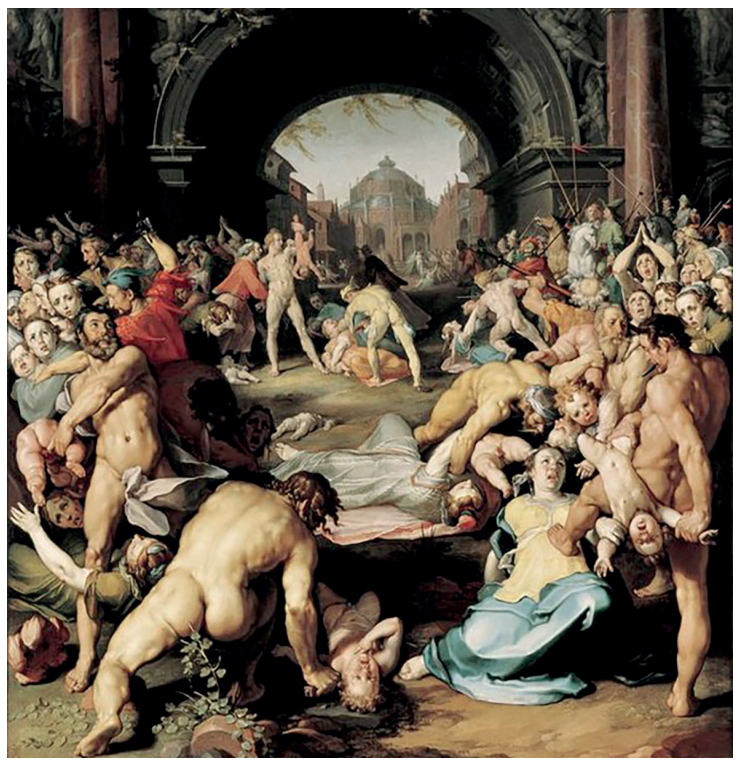
Figure 18. Cornelis van Haarlem – Massacre of the innocents in Bethlehem (1591) – Frans Hals Museum