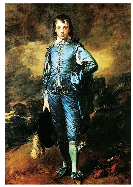
Thomas Gainsborough – Blue boy (ca. 1770) – Royal Collection – Windsor Castle

painting harmoniously fuses the Northern sensibility for subtle light shades with the caravaggesque tendency to stark chiaroscuro. The artificially lit scenes do not share the caravagessque harshness but show a typical Dutch intimacy. Such stark naturalistic chiaroscuro light scenes soon influenced Netherlandish painting and contributed the dissemination of Caravaggio's style in Holland through the Utrecht School, consisting principally of Honthorst himself, Dirck van Baburen (c. 1590–1624), Hendrik Terbrugghen (1588–1629) and Jan van Bijlert (1597–1671). They introduced the dramatic chiaroscuro and established new stylistic and iconographic models that were soon imitated by other artists and contributed to Netherlandish cultural mobility.