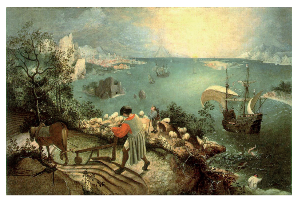
Figure 6. Pieter Bruegel the Elder – Landscape with the Fall of Icarus (1558) – Royal Museum of Fine Arts of Belgium, Brussels

Bruegel was the genial exception and in that he differed from many of his contemporaries who were infatuated with the luster of Rome. A typical example is Jan Gossaert (1478-1532), who is often considered as the first Renaissance artist or 'Romanist' from the Low Countries and who went to Italy in 1508 as a member of the entourage of Prince Philip of Burgundy. Gossaert was fascinated by the great Roman sculptures he discovered in the Courtyard of the Sassi family and in the Palazzo dei Conservatore in Rome (Ainsworth 2010) and introduced an innovative Italian sculptural approach in Netherlandish painting, but he remained loyal to the extraordinary meticulous style inherited from the Van Eyck tradition. In Saint Luke painting the Virgin (ca. 1520) (Figure 7) (Prague, Narodni Museum), for instance, he faithfully follows the Flemish verism and the almost gothic plasticity of Van der Weyden, lending the virgin Mary a sculptural volume and a warm sensuality, but he situates this typical Flemish scene in an Italianate spatial structure with striking effects of perspective foreshortening. The integration of Italian innovations in the Flemish tradition certainly had an impact on the cultural identity of Netherlandish art, but did not wash it away. Despite the obvious Italian influence, Jan Gossaert remained recognizably tied to the Netherlandish tradition (Beheydt 2002).