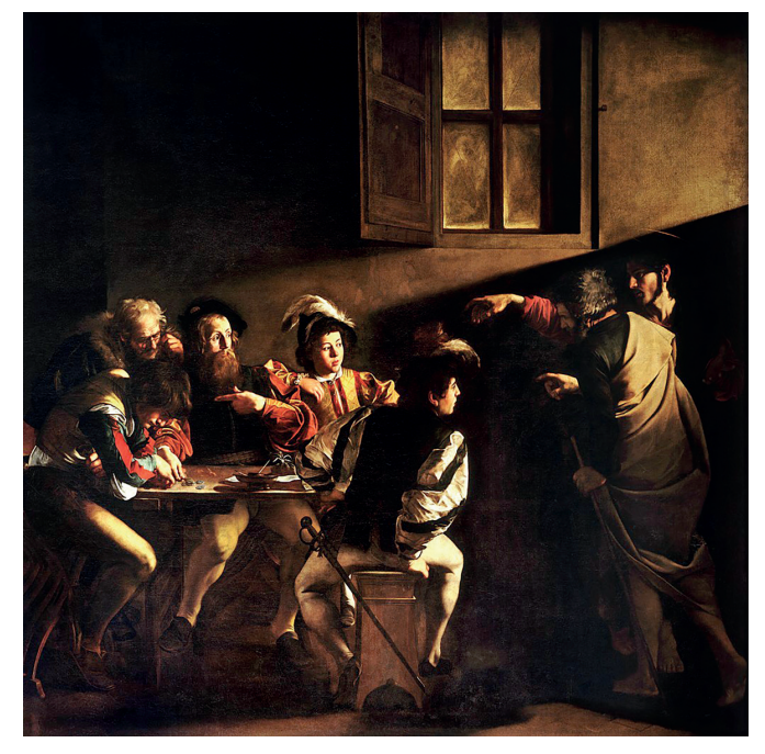
Figure 20. Michelangelo Merisi da Caravaggio – The Calling of Saint Matthew (1599–1600) – San Luigi dei Francesi, Rome