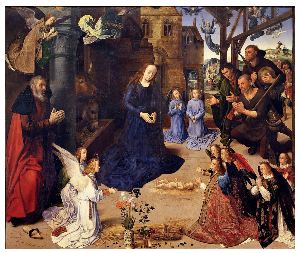
Figure 10. Hugo van der Goes - Portinari triptych (1475) - Uffizzi, Florence

It is not only the actual mobility of artists that causes cultural mobility, the movements of works, images and ideas certainly contributes to the dynamic character of cultural identity as well. Paula Nuttall (2004), for instance, has convincingly shown, how during the quattrocento Italians came into contact with Netherlandish pictorial models – through drawings, model books, prints, and certain Netherlandish paintings that were displayed in Florence in accessible locations. She also subtly analyzed the modes of