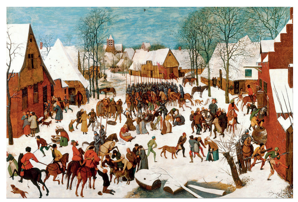
Figure 19. Pieter Bruegel the Elder – Massacre of the innocents in Bethlehem (ca. 1565–67) – Royal Collection, Windsor Castle