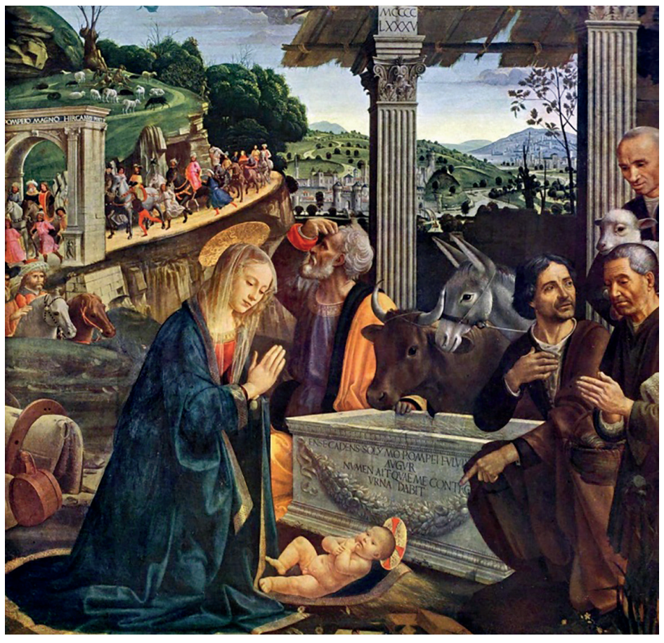
Figure 11. Domenico Ghirlandaio – Adoration of the Shepherds (1485) – Sassetti Chapel panel, altarpiece, Florence

action in his paintings in the Italian way. But, again, the influence was reciprocal. Marcantonio Raimondi, in turn, copied part of a landscape from a print by Van Leyden.