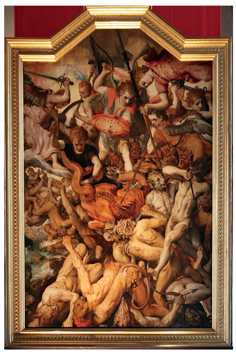
Figure 4. Frans Floris Devriendt – Fall of the Rebel Angels (1554) – Royal Museum of Fine Arts, Antwerp