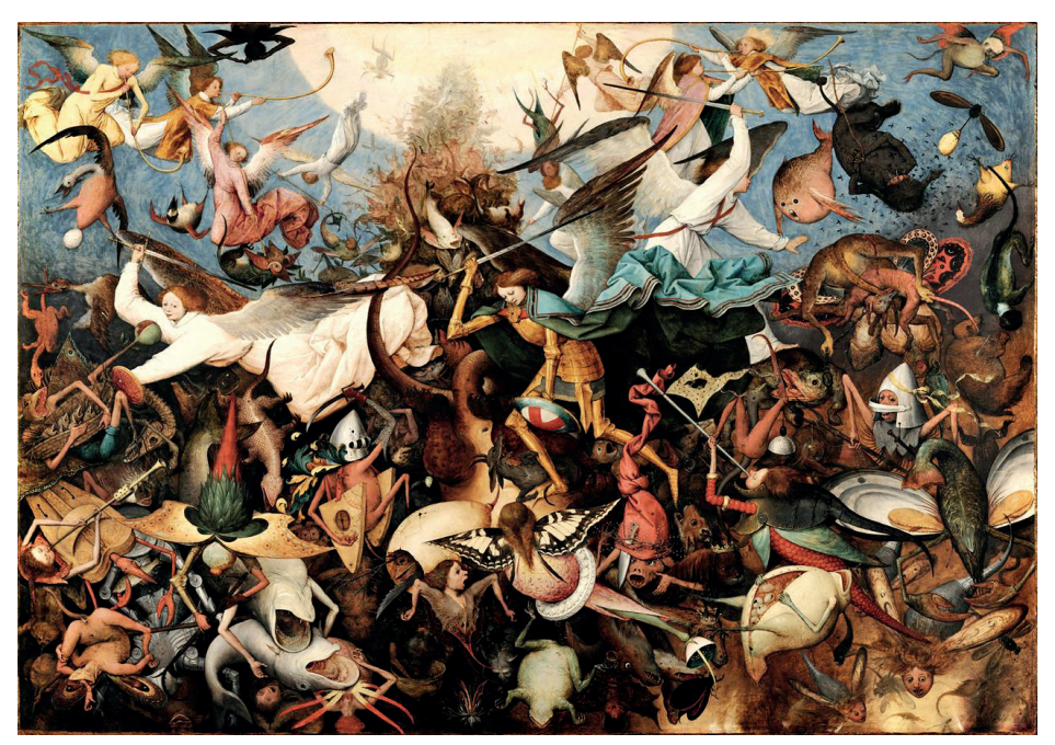
Figure 5. Pieter Bruegel the Elder – The fall of the Rebel Angels (1562) – Royal Museums of Fine Arts of Belgium, Brussels

No lack of genius on the other hand in the work of Pieter Bruegel the Elder who also made his 'Journey to Italy', but who did not want to impress by imitation of the Italians. On the contrary. If we consider his elaboration of the same theme of The Fall of the Rebel Angels (1562) (Figure 5), we are enchanted by the straightforward Flemish gift for fantastic and visionary art. In the great grotesque chaos a circle of light is coming down to the darkness of hell presenting us with the demonic atrocity of damnation. The appalling menagerie of hybrid monsters is chaotically at war with the Saint Michael.