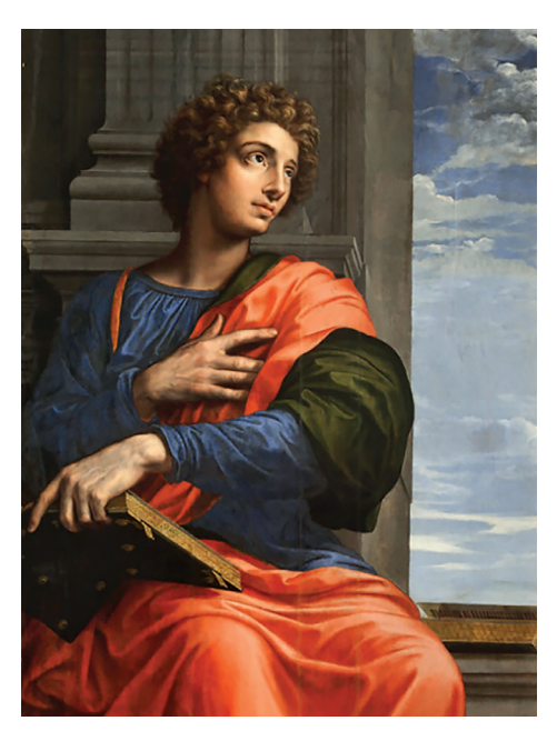
Figure 3. Michiel Coxcie – St. Luke Altarpiece ( detail ) – National Gallery Prague