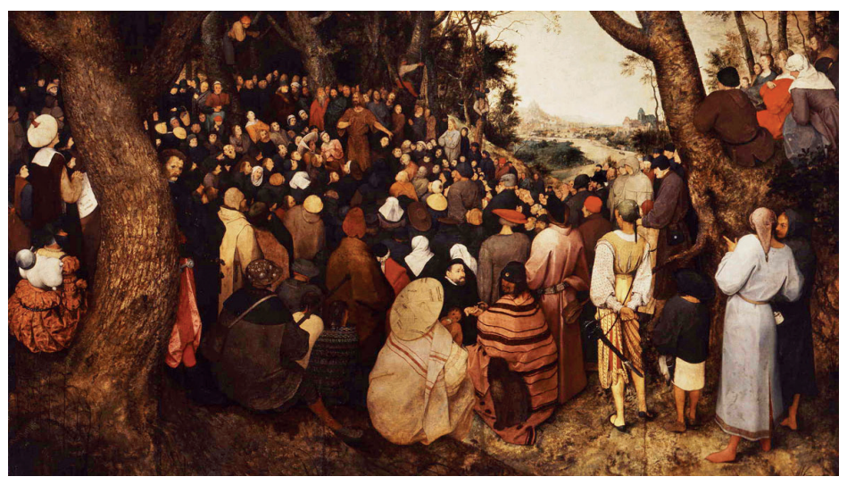
Figure 12. Pieter Bruegel the Elder – The Preaching of Saint John the Baptist (1566) – Museum of Fine Arts, Budapest

a deathbed scene of the Holy Mary, which had profound Catholic connotations, showing the Virgin Mary, a figure largely marginalized in Protestant belief, was recuperated by the 'Protestant' artist Rembrandt van Rijn in a mixing process that resulted in the etching The Death of the Virgin (1639). This disquieting presence of a Catholic subject that was hardly acceptable to Dutch Protestant eyes, illustrates that Rembrandt subversively acknowledged the place of the Virgin Mary in the Catholic visual practice and the contemporary Catholic theology of his age (Barker, 2010). It also demonstrates that fundamental hybridization dynamics of cultural mobility and "the creativity of reception and the renegotiation of meaning" (Burke 2009: 107) take place in encounters.