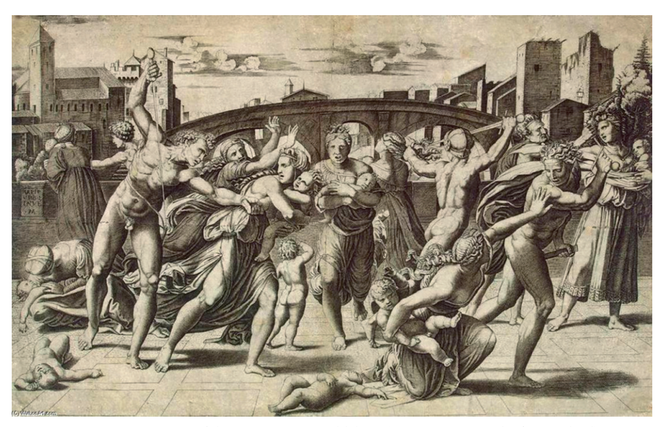
Figure 17. Massacre of the innocents in Bethlehem (Antonio Raimondi after Raphaël)