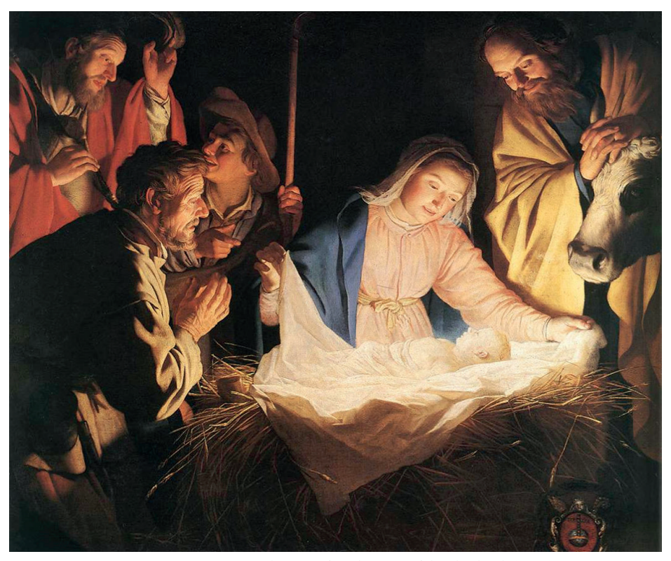
Figure 8. Gerrit van Honthorst – The adoration of the Shepherds (1622) – Wallraf-Richartz Museum, Cologne

landish iconography, introduced a composition technique totally inspired by Caravaggio (Judson, 1959). The Adoration of the Shepherds (Figure 8) signed by Honthorst in 1622 at a glorious moment in his career, is an iconic example of the harmonic reconciliation of the stark chiaroscuro's of Caravaggio on the one hand, and the typical Dutch gift for subtle effects of light on the other hand, not unlike those of Johannes Vermeer.