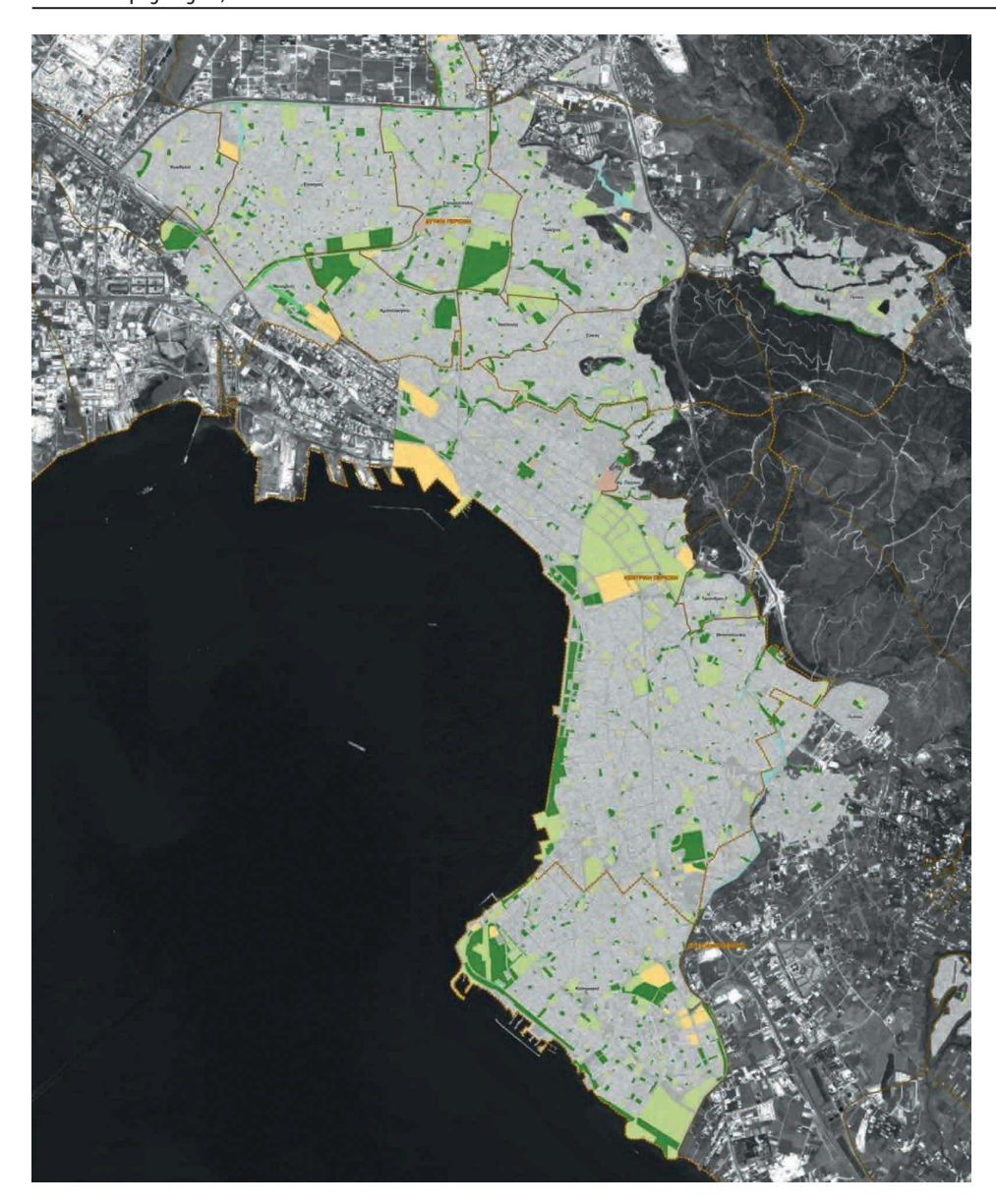
Fig. 2 Green spaces in the urban agglomeration of Thessaloniki.

policy factors), Thessaloniki is notable for a better embedding of the feature "green" compared to Athens, and for providing easier access to green spaces for its citizens (due to their dispersion).