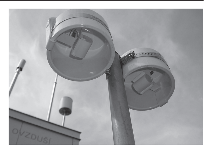
Fig. 1 Diffusive sampler Ogawa.

For our measurements, we used the commercial Ogawa sampler (Ogawa and Co., Pompano Beach Florida), which is widely and successfully used for measuring O_3 in U.S. National Parks (e.g. Manning et al. 1996; Cooper and Peterson 2000). Koutrakis et al. (1993), who validated the Ogawa sampler, report that a relative humidity ranging from 10 to 80% and temperature ranging from 0 to 40 °C do not influence the performance of the sampler at typical O_3 levels (40–100 ppb). Fig. 1 shows the Ogawa