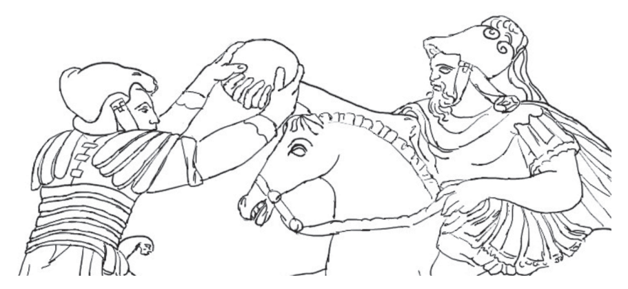
Fig. 2. Paolo della Stella, Allegory of Dynastic Succession (partial reconstruction indicating position of fingers holding the globe), 1538–1550 (drawing Nina Bažantová).

The erroneous reconstruction was inspired by a different coin from the reign of Titus: one showing the standing togate Vespasian presenting the globe to the standing togate Titus. Under the globe is a rudder, another symbol of world rule (Carradice, Buttrey 2007: 209, no. 161–162). This coin was published by Vico (Fig. 4), who shortened the inscription PROVIDENT AVGVST to PROVIDEN AVG and left out the rudder (Vico, Zantani 1548: 51; Vico 1554: LI). We find the same coin also in Du Choul's book (Fig. 5) which was published ten years later (Du Choul 1556: 68). Du Choul comments on the coin in a similar vein to Erizzo: "in ancient times, Providence was considered to be a deity ... They represented her as a woman in a long dress holding a sceptre in one hand and the globe in another ... In this way, she was represented on medals of Trajan ... The other emperors (such as Titus) represented her with a rudder and a globe, with which they denoted the rule of the world" (Du Choul 1556: 66–67; my translation). On the coin published by Vico and Du Choul, there is an inscription Providentia Augusti (Imperial Providence), which appeared on the coins of many Roman Emperors. In the sixteenth century, it was known that the orderly imperial succession was an important aspect of imperial