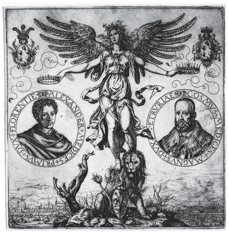
Fig. 10. Martin Rota, Alessandro, and Cosimo de' Medici crowned by a goddess standing on a lion, engraving from 1569–1574.

In Piero di Cosimo's image, the broncone is anthropomorphic; we clearly distinguish a face with an open mouth. The focus of the sea monster is not Andromeda, but this face. The dragon (Republican government) seems to be attacking the Princess (Florence), but a stream of water coming out of his nostrils falls not on Andromeda, but on the broncone 's face (Medici dynasty). The stream of water has a symbolic meaning. The more a tree is threatened, the more it grows, exactly as in the traditional wisdom, that what does not kill us, makes us stronger.