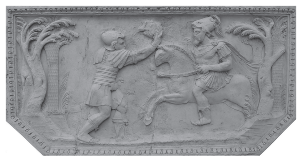
Fig. 1. Paolo della Stella, Allegory of Dynastic Succession, second spandrel of the northern façade of the Prague Belvedere (from left to right), sandstone relief sculpture, 1538–1550.