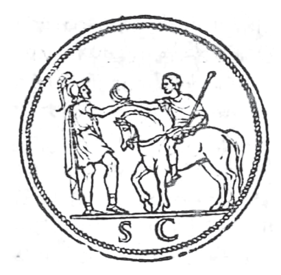
Fig. 3. Incorrect reconstruction of the reverse of the sestertius of Titus minted in 80–81 AD, woodcut (Erizzo 1559: 195).

The erroneous reconstruction was inspired by a different coin from the reign of Titus: one showing the standing togate Vespasian presenting the globe to the standing togate Titus. Under the globe is a rudder, another symbol of world rule (Carradice, Buttrey 2007: 209, no. 161–162). This coin was published by Vico (Fig. 4), who shortened the inscription PROVIDENT AVGVST to PROVIDEN AVG and left out the rudder (Vico, Zantani 1548: 51; Vico 1554: LI). We find the same coin also in Du Choul's book (Fig. 5) which was published ten years later (Du Choul 1556: 68). Du Choul comments on the coin in a similar vein to Erizzo: "in ancient times, Providence was considered to be a deity ... They represented her as a woman in a long dress holding a sceptre in one hand and the globe in another ... In this way, she was represented on medals of Trajan ... The other emperors (such as Titus) represented her with a rudder and a globe, with which they denoted the rule of the world" (Du Choul 1556: 66–67; my translation). On the coin published by Vico and Du Choul, there is an inscription Providentia Augusti (Imperial Providence), which appeared on the coins of many Roman Emperors. In the sixteenth century, it was known that the orderly imperial succession was an important aspect of imperial