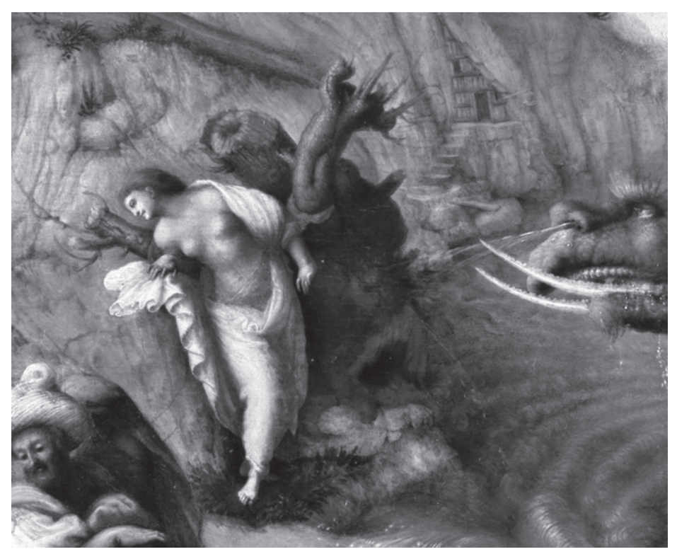
Fig. 9. Piero di Cosimo, detail of Andromeda and broncone, 1515.

The figure of Andromeda in the Belvedere relief was evidently inspired by a painting of 1515 by Piero di Cosimo (Geronimus 2006: 108-115; Hirschauer, Geronimus 2015: 202-204).<sup>2</sup> His Andromeda is tied to a huge old tree as in a woodcut of 1497 (Bonsignori 1497: e2r; Díez Platas 2015), but with cut-off branches and new shoots sprouting from the stump (Fig. 9). This trunk evokes the broncone , which was one of the emblems of the Medici, who celebrated the indestructibility of their dynasty in this way (Cox-Rearick 1984: 234-235; Walker-Oates 2001; Langdon 2006: 29-30). Although all but one branch has been cut off, that branch may sprout again. The Medici were repeatedly removed from power in Florence, but always regained the city and restored their power. Three years before Piero's image was created, the Medici triumphantly returned to Florence from the exile which they had endured since 1494. Piero's Perseus can be regarded as the alter ego of a member of Medici dynasty, who ended the Republic. Hero slew the monster (Republican establishment) and freed Andromeda (Florence). Andromeda is not chained by iron, as we see in all the later depictions. She is fastened to the tree stump with a ribbon. The stump of the tree (Medici dynasty) does not imprison Andromeda; on the contrary, it provides her with a decorative and protective enclosure.