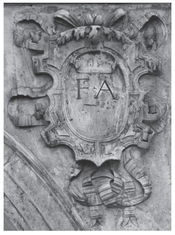
Fig. 7. Paolo della Stella, shield with monogram: FA (Ferdinand and Anna), sixth spandrel on the northern façade of the Prague Belvedere, sandstone relief sculpture, 1538–1550.

The Czech estates were very well aware of what they had lost by agreeing to the re-evaluation of Ferdinand's ascension to the Royal throne. They never came to terms with this setback and insisted that the next ruler would once again be elected by free elections. The decoration of the Prague Belvedere was in reaction to this high-principled stance of the local political representation. On its northern façade, we find the coat of arms of the Bohemian Kingdom, the scene celebrating dynastic succession, together with the two initials, "FA". This sequence of images emphasised that the Bohemian Kingdom was inherited Habsburg land. The monogram "FA" was, above all, a celebration of the founding of the Habsburg monarchy in Central Europe, where the Czech Queen played the