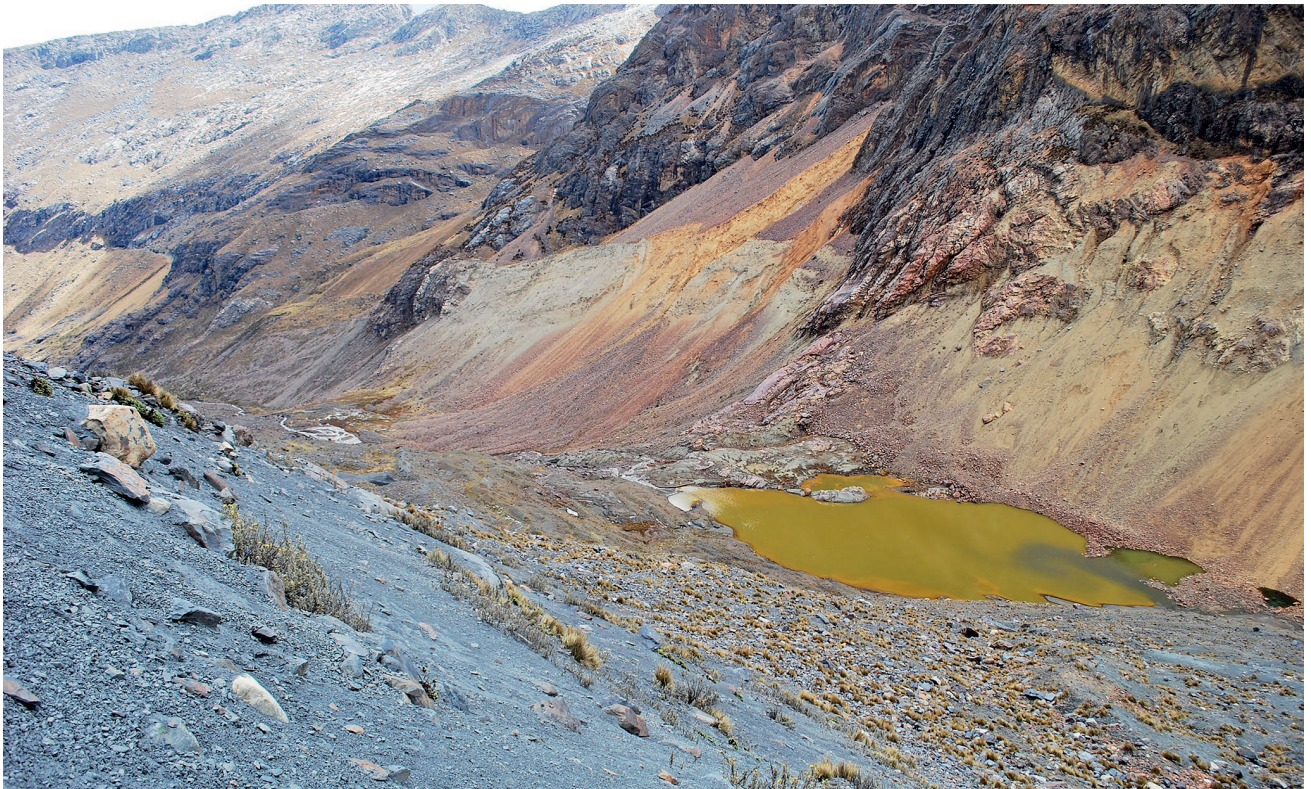
Fig. II Photo of the Uruashraju Lake taken from the moraine to the west. On the right site of the photo are visible debris flows source areas with accumulations