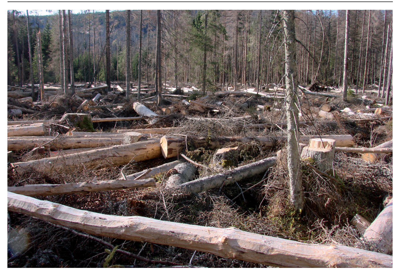
Fig. 4 Clear felling aimed at stopping the bark beetle from spreading.

to a change in the vegetation cover as snow in treeless landscapes or in forest without mature trees is not shaded and melts earlier. Furthermore, an evident air temperature increase causes an earlier snow melt in the Czech Republic and that's why the spring maximum run-offs shift from April/May to March/April in mountainous areas (Hruška et al. 2016).