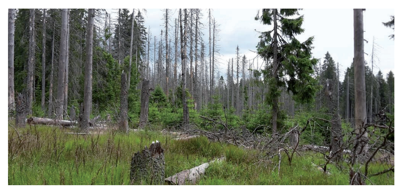
Fig. 3 "Grey" forest about 10 years after the bark beetle attack, in which natural regeneration of the forest is occurring.

ment area in the surroundings of Březník, which is in an unmanaged forest zone. In this area it is possible to determine whether floods and droughts are more likely where the forest is dead. The catchment area of Modravský potok includes three areas: one covered with green forest, one with dead forest and one with clearings and other land. The run-off from these areas was measured using a limnigraph above Modrava village and the amount of precipitation was obtained from a nearby meteorological station (Filipova Huť). The data for this study was collected from 1971-2015. Changes in the precipitation /run-off ratio would indicate that forest clearings have an effect. However, the annual run-off of the Modravský potok did not change (Hruška et al. 2016). The increase in run-off in March and April could have been caused by several factors (Hais et al. 2006). This could be partly due