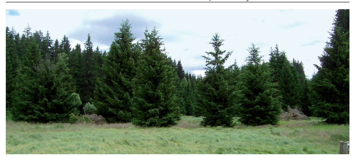
Fig. 2 Green forest without signs of damage in the unmanaged zone.

in the initial phases after the attack, before the massive re-growth of new trees occurs. But what about forest that has been clear cut to stop a bark beetle attack?