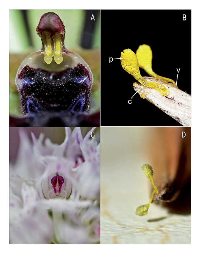
Fig. 1 Detailed images of flowers and pollinaria of N. tridentata and O. mammosa . Reproductive parts of Ophrys mammosa (A) and Neotinea tridentata (C). Pollinarium of Ophrys mammosa (B) and Neotinea tridentata (D); p: pollinium, c: caudicle, v: viscidium.

Germination tests were started in March and April 2014. The surfaces of pollinia were sterilized by placing them in a 0.5% solution of NaOC1 for 5 minutes after which they were rinsed three times in sterile distilled water and between rinses they were broken into pieces in a vortex mixer.