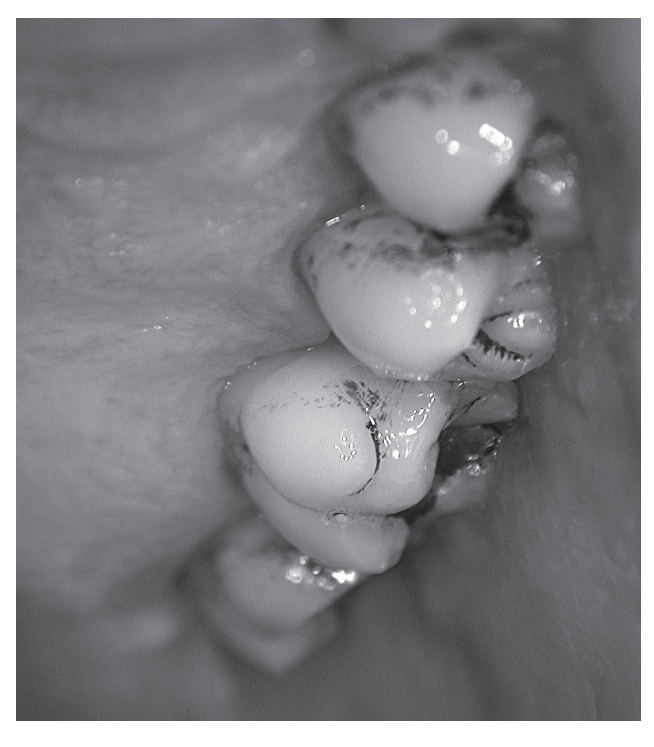
Fig. 1: Postoperative intraoral view on palatal aspects of upper posterior teeth. Note the very small gingival recession at the first upper molar done by a minimal postoperative shrinkage of the previously mobilized gingival flap to get access to the persistant infrabony defect

The two cases, in which we observed in the postoperative period premature loosening of the suture associated with exposure of the augmentation material into the oral cavity, resulted in reepithelisation of the dehiscence and successful healing of both surgical wounds. In conclusion, postoperative complications occurred in 50% of the treated individuals, however, they did not affect the success of the treatment. Higher price will be considered as a time- and