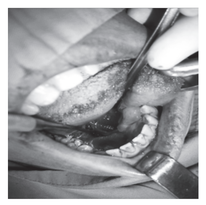
Fig. 2: Patient No. 1– intraoperative finding