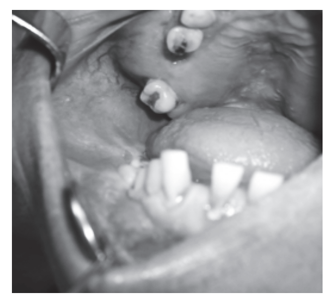
Fig. 4: Patient No. 2– preoperative status