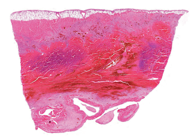
Fig. 1: Transmural myocardial infarction in the anterior wall of the left ventricle, modified by reperfusion (hematoxylin-eosin)