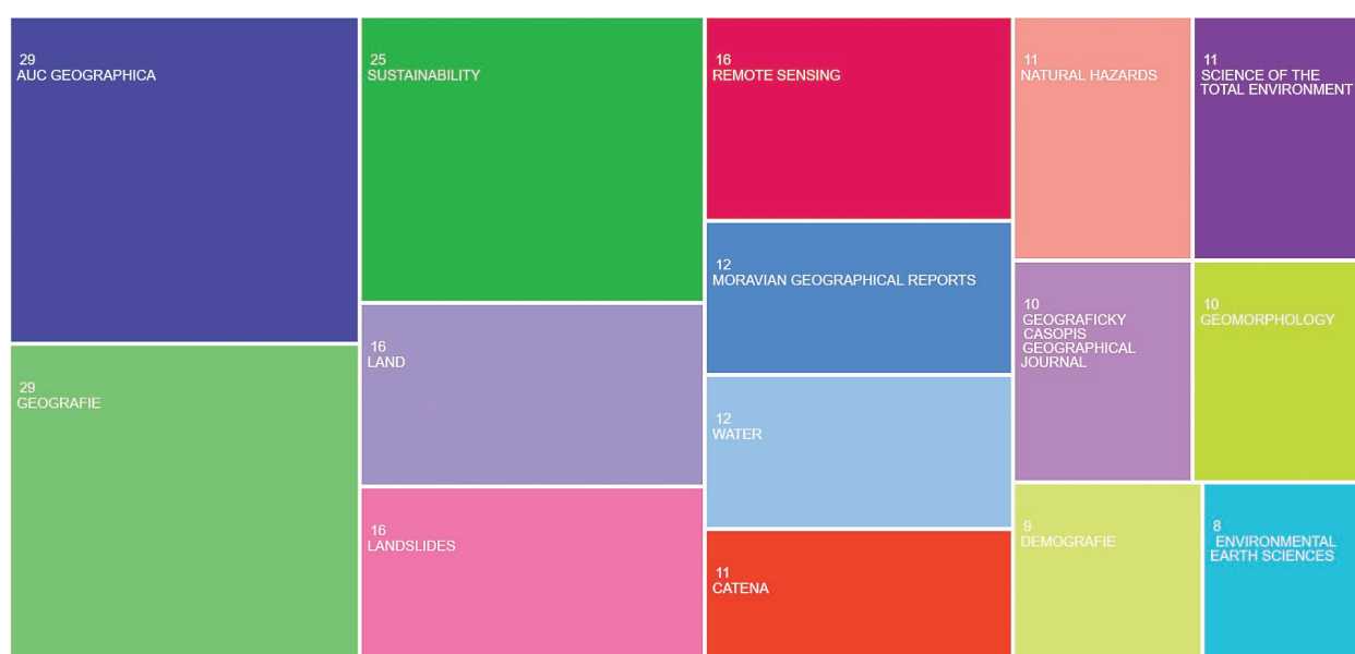
Fig. 2 Journals that most frequently cite articles from AUC Geographica published between 2015 and 2025 (as of 8 September 2025). Note: The citations were tracked only for the “Article” document type. The 15 most frequent titles are displayed, which account for approximately 27% of the total number of citations. Only 16% of all the citations were from authors at Charles University, and 34% from Czech authors.

We aim to focus on strengthening international cooperation, supporting multidisciplinary research, and reflecting global geographical challenges (e.g. Brodský et al. 2024). AUC Geographica must remain a platform for innovation and critical discussion for renowned geographers, as well as a publication that continues to support the younger generation of scientists and to offer them encouragement to enter the publishing process. The journal should remain a forum for the exchange of ideas and the foundation upon which the future of geographical science is built.