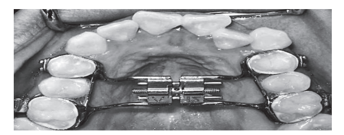
Fig. 3: Rapid maxillary expansion (RME). Adapted from Kilic N, et al. Int J Pediatr Otorhinolaryngol 2008.

There are some lifestyle changes, that may be very effective in mitigating the symptoms of paediatric OSAS.