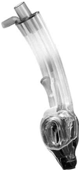
Figure 1 – Baska® mask – a novel extraglottic airway device with a self-energizing mechanism of sealing.