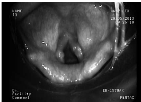
Figure 4 – Fiberoptic view through the correctly inserted i-gel airway.

Obese patients are another controversial indication for using of EADs. Several studies report successful airway maintenance during elective anaesthesia procedures using ProSeal LMA, Supreme LMA, SLIPA or i-gel airway (Natalini et al., 2003; Weber et al., 2011). Patients with mild (BMI > 30) or moderate (BMI > 35) obesity may tolerate these airways better than tracheal tube. A recent meta-analysis has shown that relevant data comparing tracheal tube and EADs in obese patients are available only for ProSeal LMA (Nicholson et al., 2013). Extraglottic airway devices may be used in obese patients as conduits for tracheal intubation –