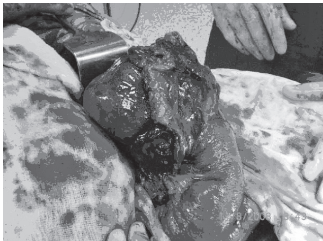
Figure 2 – Peroperative explorative findings. The tumor was located in the ileum, 8–10 cm from the ligamentum Treitz. The tumor was surrounded by transverse colon.

primary side to side anastomosis. Tumor resection and primary repair of the serosa in the left colon was performed.