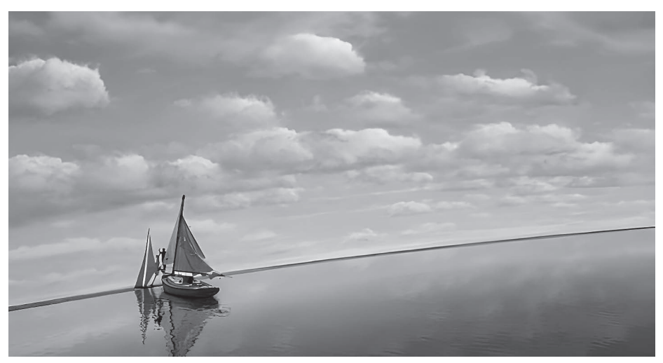
Fig. 1: Truman hits the wall of his prison; The Truman Show 1998.

Against the will of the showrunner, Truman discovers the true nature of his world and decides to escape it. He overcomes his fear of the deep sea and sails away from his hometown on a boat. To his surprise, the boat eventually hits the outer wall of the studio with sky and clouds painted on it (fig. 1). He finds the escape hatch with the word "EXIT" written on it and leaves his prison, never to return (fig. 2).