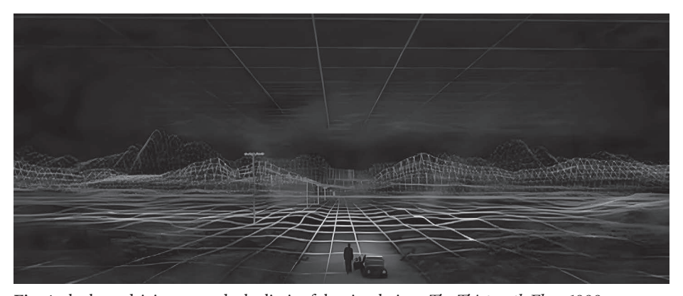
Fig. 4: the hero driving towards the limit of the simulation; The Thirteenth Floor 1999.