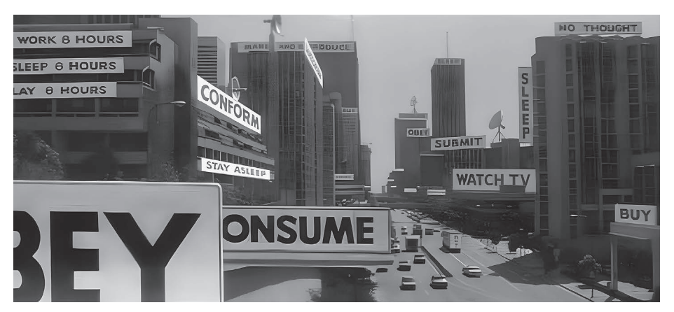
Fig. 3: Nada looks through the sunglasses and sees the real message behind the billboard advertisements; They Live 1988.

ses can be easily found online. I will therefore offer just a couple of sentences for each film to provide a basic orientation for those who have not seen them: ^{33}