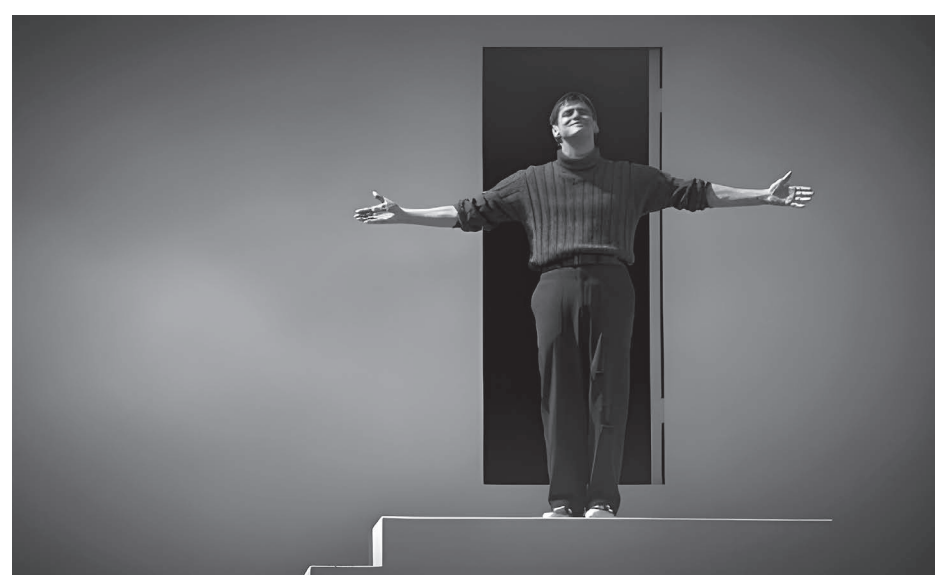
Fig. 2: Truman bows to the audience and leaves the Truman Show through the exit door; The Truman Show 1998.